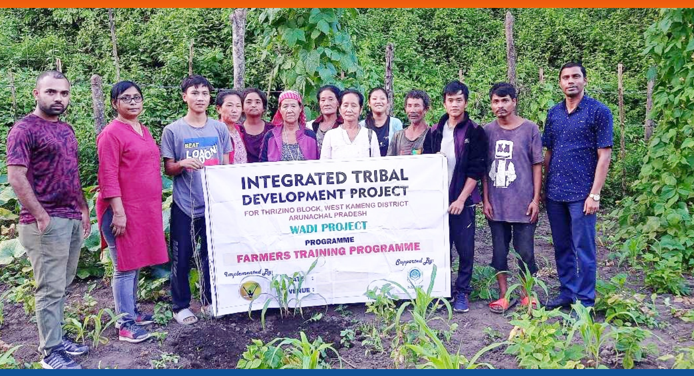
Farmers training and demonstration at Palizi