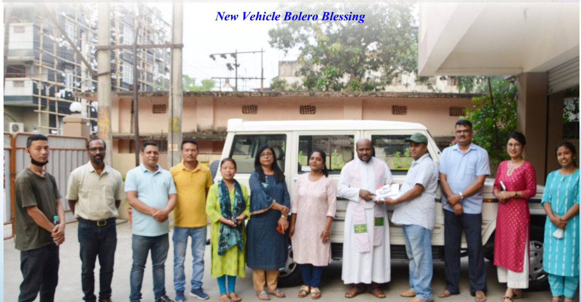
New Vehicle Bolero Blessing