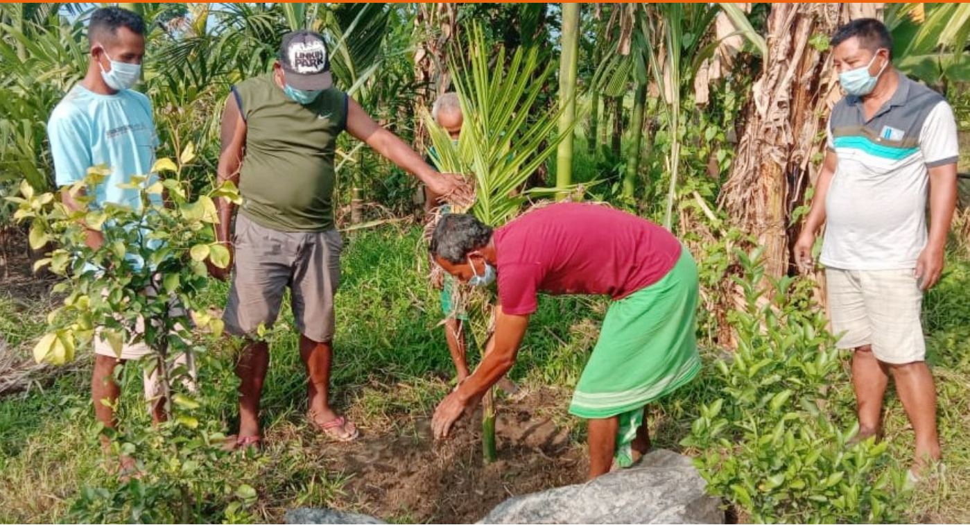
BAGAN Project - On Field Farmers Training and Demonstration