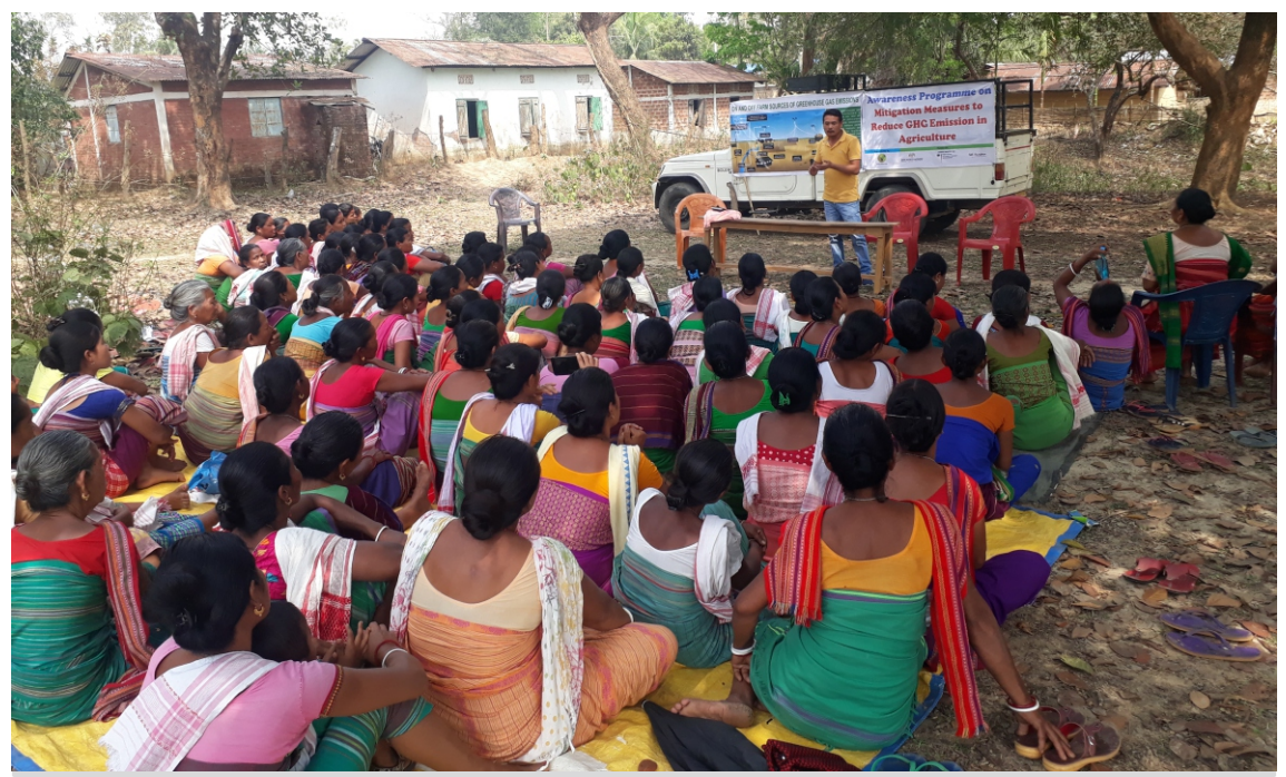
Awareness Programme on Mitigation to Reduce GHG Emission in Agriculture