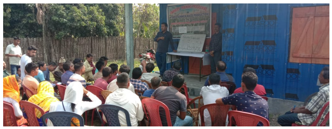
Bosco Reach Out

The Agriculture Development Officers shared the various schemes which the farmers obtained from the Agriculture Department. The farmers expressed their appreciation to the Agriculture Development Officers for sharing their valuable knowledge. They also discussed issues related to crops like paddy and chilli the coming season. The farmers are delighted to associate with the concerned government department to seek guidance and help in the due course of agriculture farming.