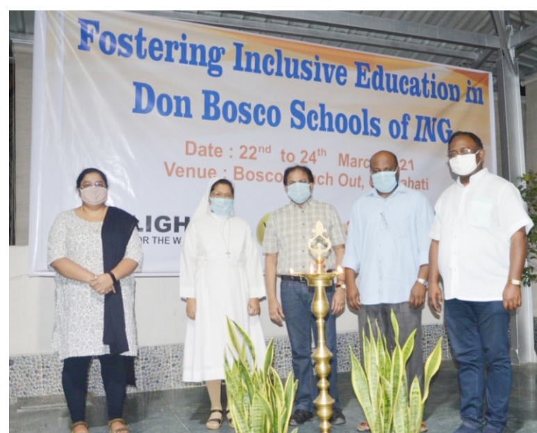
Bosco Reach Out

The Salesian Province of Guwahati has entrusted Bosco Reach Out to implement Inclusive Education for Children with Disabilities in the Don Bosco Schools of the province. For this pilot intervention, the provincial council selected five Don Bosco S chools of Boko, Sashipur, Damra, Sojong and Umswai.