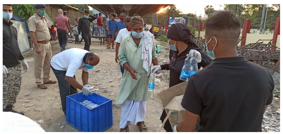
Covid-19 Pakage Food Distribution