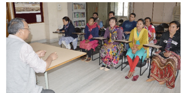
Bosco Reach Out

Bosco Reach Out selected five Solar Mamas from Umrangso to attend three months skill up gradation training at Barefoot College, Tilonia, Rajasthan to start an Enterprise Model in addition to the existing Solar Mamas Model. The new Model will enable them to reach out more communities and to equip the Solar Mamas with more skills. It will able to bring a range of products to the communities that are fabricated by the Mamas and will enable them to create an additional income stream for themselves. The training class will begin on February 10, 2019.