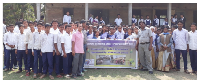
Bosco Reach Out