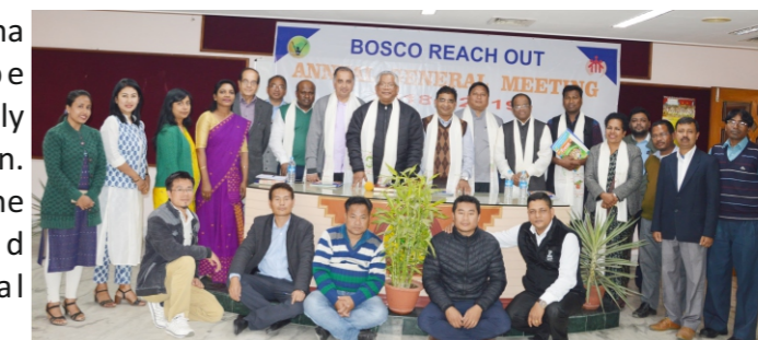
Bosco Reach Out