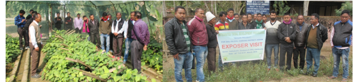
Educational Exposure Visit