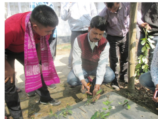
Bosco Reach Out

The objectives the exposure visit was to observe, understand and learn the various technical aspect of horticulture, to enhance the knowledge and skill of the farmers on sustainable horticulture practices, to make farmers learn new skill and methods of farming, and to create an informal platform for group exchange exposure where farmers from several groups can share their experiences of farming practices.