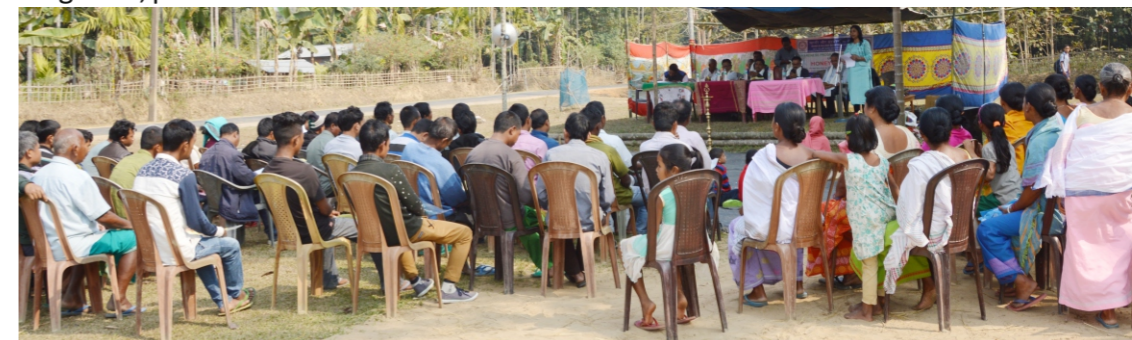
Bosco Reach Out

The objectives of the Eden Honey Bee Project involve the organization and training of beekeepers in Conservation Beekeeping, in areas such as managing the beehives, production and sale of honey and other hive by-products by drawing up guidelines for the diagnosis, prevention and treatment of bee diseases.