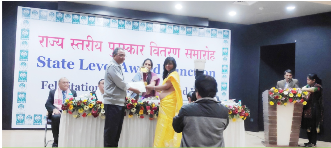
Bosco Reach Out's NABARD Project Recognised