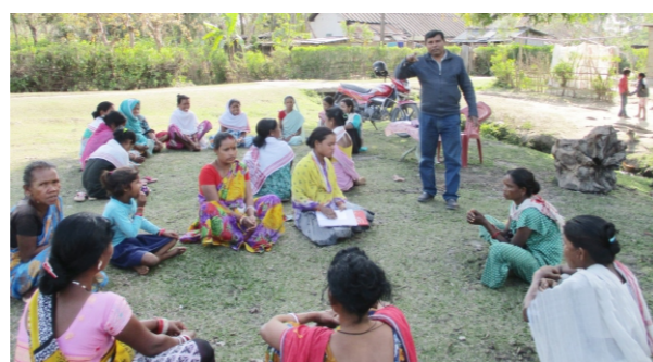
Bosco Reach Out