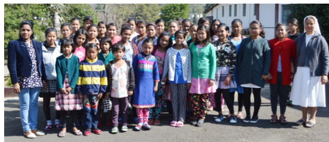
Bosco Reach Out