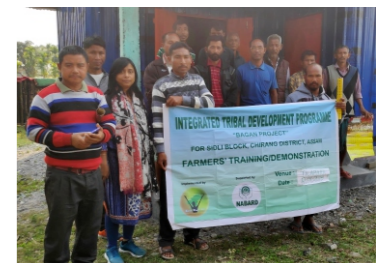
Bosco Reach Out