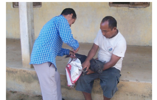
Bosco Reach Out