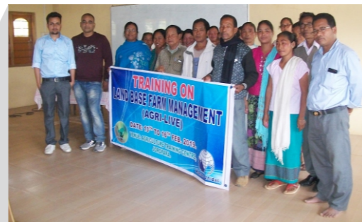
Bosco Reach Out