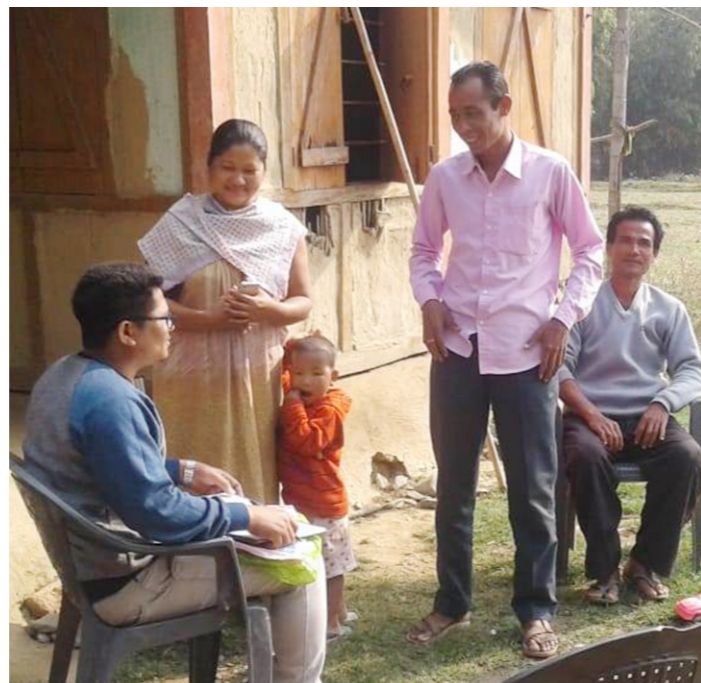
Bosco Reach Out

The objective of the campaigning was to make the farmers aware of the TDF project concept and wadi (orchard) development like asset creation for their family to increase their income and at the same time optimum utilization of family labour.