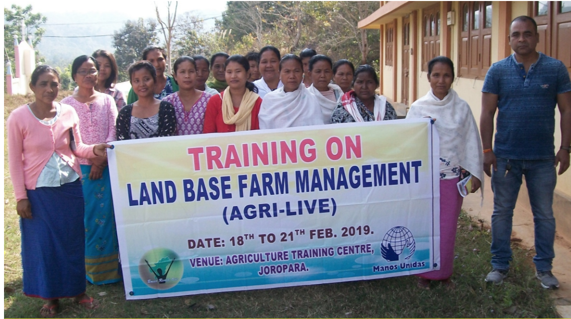
Training on Land Based Farm Management