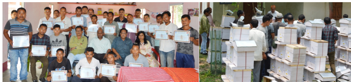
Bosco Reach Out